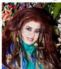
By: Shahnaz Husain

Foot hygiene is essential throughout the year, however, it is all the more crucial during monsoon.