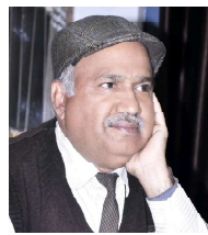
By: Vijay GarG

Conventional sources of energy like coal, gas, petroleum etc. are proving to be harmful to the environment along with being limited in quantity.